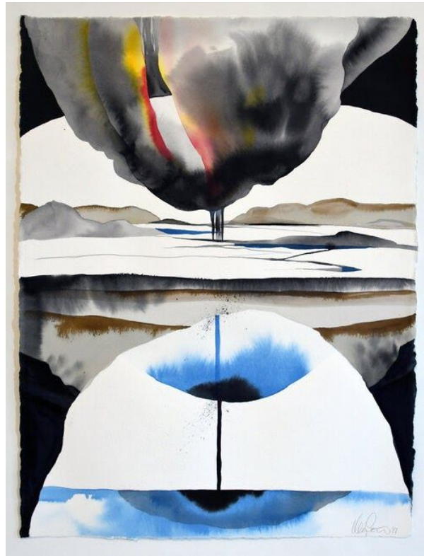
Wendy Letven, Flare-Up , 2017. Ink on Arches Paper, 30 x 22 inch.

This exhibition also features Letven's most recent paintings. The oil paintings explore flatness and space in a similar manner as her installations and sculptures. The application of layered, vibrating lines create different spatial relationships within their surfaces as they rise and fall away. The lines synchronize in areas, and then appear and disappear from one to another space. The logic and mechanism of the painted forms suggest abstract landscapes within states of synchronicity, resonance, and transformative flux.