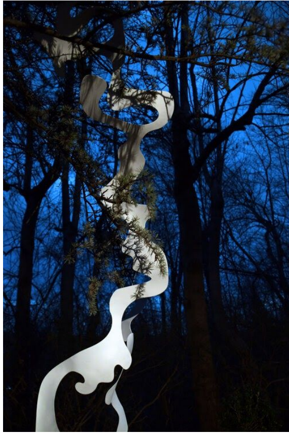
Wendy Letven, Winding River , 2020. Site-specific installation, painted aluminum, dimension variable

Letven's ink painting series started in 2010 around the time of the oil spill off the Gulf of Mexico in Louisiana. Her worries about environmental changes, such as rising sea levels and super storms, have inspired her to imagine doomsday scenarios. Abstract expressions of subverted landscapes and rivers in the sky are depicted in her ink series. The series is less about exploration of forms, as they are investigations into a variety of physical rhythms. Their inquiry into the essence of flow stems from the painterly process of ink spills and liquid pours.