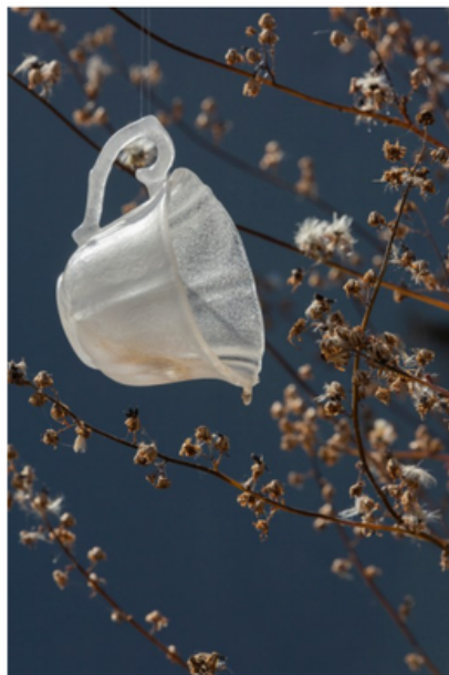
Apartment - A Pair of Cups No.2 - Apt 410 (part) , 2022. Glass, tea, handkerchief, button, Each 5.3 x 4 x 2.8 inches, total installation variable ©Meng Du, photo by Jingxin Hu, courtesy of Fou Gallery

beauty is just like fireflies, ephemeral and glimmery. But these shines are already the utmost struggles of those free spirits." In the visual language of the works, the glass is pieced together to form the imagery of windows; the mirrors reflect the ever-changing surroundings at every moment; the slender line of the drawings on the mirrors depict meaningful objects that elicit memories; the different colors such as cold green or warm red render different emotions. All kinds of these visual descriptions form the particular narrative of People Sitting by the Window .