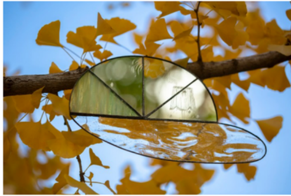
People Sitting by the Window No.4 , 2022. Glass, mirror, copper foil, 11.4 x 6.5 x 0.3 inches ©Meng Du, photo by Jingxin Hu, courtesy of Fou Gallery

made by small panels of sheet glass and mirrors collaged by the Tiffany glass technique, with delicate hand-engraved drawings on some of the mirror surfaces. The image of the works just resembles the windows in our everyday life that reveal many mundane worlds and the restless cycles of seasons. They share the atmosphere of the night city with tiny lights described by Chinese writer Wang Anyi, "The world is embedded in some sporadic corners of the city .....that