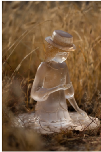
Hello, Again No.1 , 2022. Glass, tea, button, 12 x 9.8 x 12.2 inches ©Meng Du, photo by Jingxin Hu, courtesy of Fou Gallery

chapters are not chronological at all. In Tokarczuk's own words, "Constellation, not sequencing, carries truth."