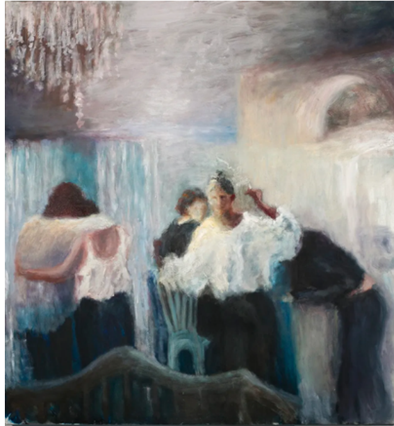
Helia Chitsazan, After Midnight , 2022. Oil on canvas, 54 x 56.7 inches ©Helia Chitsazan, courtesy of Fou Gallery

As a gallery housed in a historic brownstone building dating back to 1905, Fou Gallery's exhibition space—which resembles a grand living room—provides the inspiring setting for Helia Chitsazan: After Midnight... , enabling her works to create a cohesive contextual narrative that is centered around the concept of “home.” This theme serves to emphasize the emotional weight that is inherent in the moments depicted in her art.