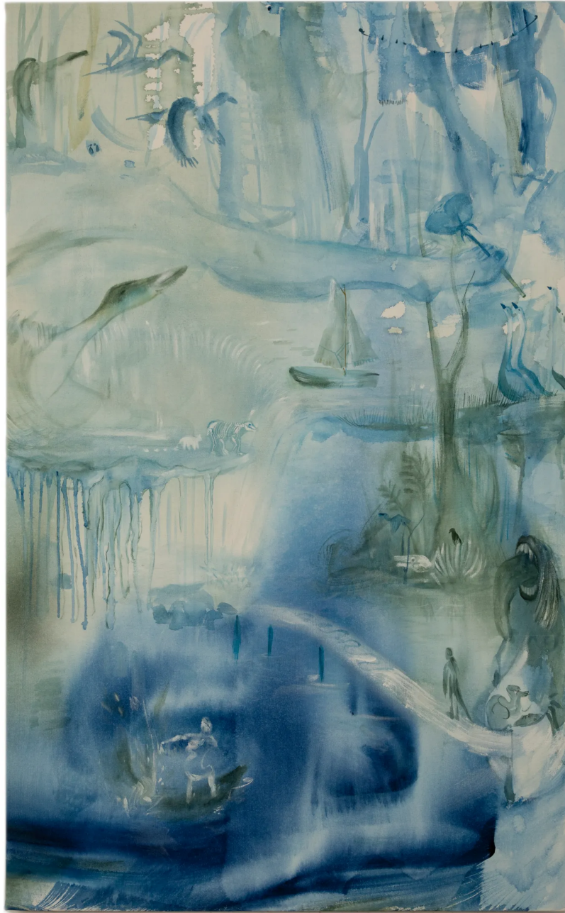
Saba Farhoudnia, Her Bridge to the Blue Rose , 2024. Acrylic on canvas, 42 x 26 inches

contemplation on humanity's precarious existence, navigating through an unstable present toward an indeterminate future.