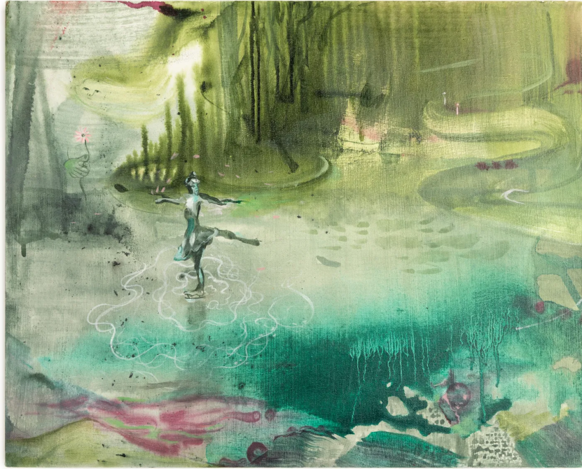
Saba Farhoudnia, Where Do I Begin , 2024. Acrylic on canvas, 16 x 20 inches ©Saba Farhoudnia, courtesy of Fou Gallery