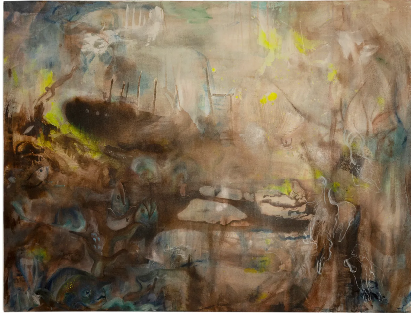
Saba Farhoudnia, Flying from the Sanchi , 2022. Acrylic on canvas, 48 x 64 inches ©Saba Farhoudnia, courtesy of Fou Gallery

Farhoudnia's philosophy, encapsulated in her poignant statement, "With each fallen petal, another rose will bloom. This is our battlefield. This is our Eden," reveals the dual nature of her artistic vision. Through " Falling Petals, Standing Roses ," she navigates the dualities of existence, crafting a narrative that oscillates between conflict and tranquility, despair and hope. The exhibition is designed to evoke the liminal space between dreams and reality, where the ephemeral beauty of life is captured in its most vivid form.