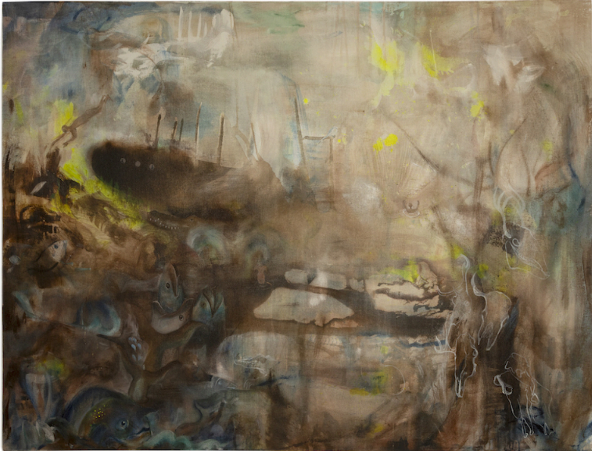
Saba Farhoudnia - Flying from the Sanchi, 2022. Acrylic on canvas; 48 x 64 inches

However, the most powerful aspect of her unique artistic style is the meticulous layering process, where colors mix and textures overlap to form intricate visual narratives. Farhoudnia employs animal, human, and geometrical forms that are masterfully placed to create a rich composition and depth.