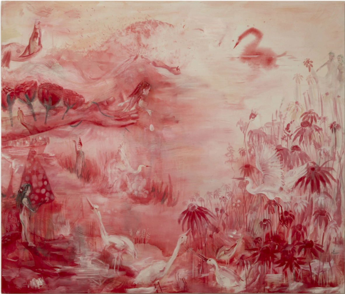
Saba Farhoudnia - Falling Petals, Standing Roses, 2024. Acrylic on canvas; 46 x 54 inches