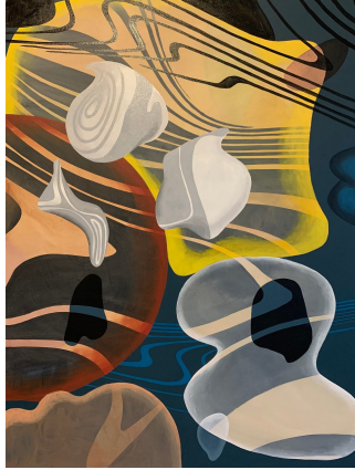
Wendy Letven, In the Current , 2020. Oil on canvas, 48 x 36 inch. ©Wendy Letven, courtesy Fou Gallery. 温迪·勒特文, 涌流之间, 2020. 布面油画, 116.8 x 91.4 cm ©温迪·勒特文, 致谢否画廊