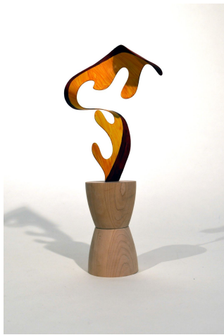
Wendy Letven, Flame , 2020. Painted Aluminum with on Maple Base, 18 x 8 x 5 inch ©Wendy Letven, courtesy Fou Gallery. 温迪·勒特文, 焰, 2020. 枫木底座上设色铝板, 45.7 x 20.3 x 12.7 cm ©温迪·勒特文, 致谢否画廊